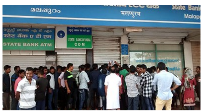
Figure 1. Line outside a bank before opening hours during demonetization

weekly limit of ₹20,000 (~US $300). These notes represented more than 85% of all currency used in India [1]. The move, commonly referred to as "demonetization," disrupted markets, caused commotion at banks (Figure 1), stock market and real estate drops [2] and even deaths [3] among those standing in long cash queues. The move was at the center of much discussion for its questionable economic logic [4, 5], its implementation without stakeholder consultation, and even its legal basis [6].