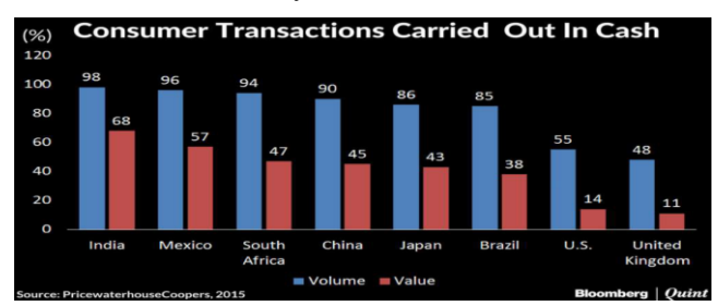
Figure 3. Scale of cash transactions in India compared to other nations [17]

However, in terms of the overall forms of non-cash payments — debit and credit cards, e-banking services, and digital wallet services — only debit cards were used by a significant proportion of the population for daily transacting. Before demonetization, about 818 million debit cards were in operation in India, compated to fewer than 29 million credit cards [16], with debit card transactions far exceeding credit transactions. Non-cash transactions were limited to a minority of Indians (Figure 3). However, while cash shortage following demonetization made digital transacting convenient and clearly increased digital transactions in scale, there were still various deep cultural barriers to moving large numbers of Indians away from cash.